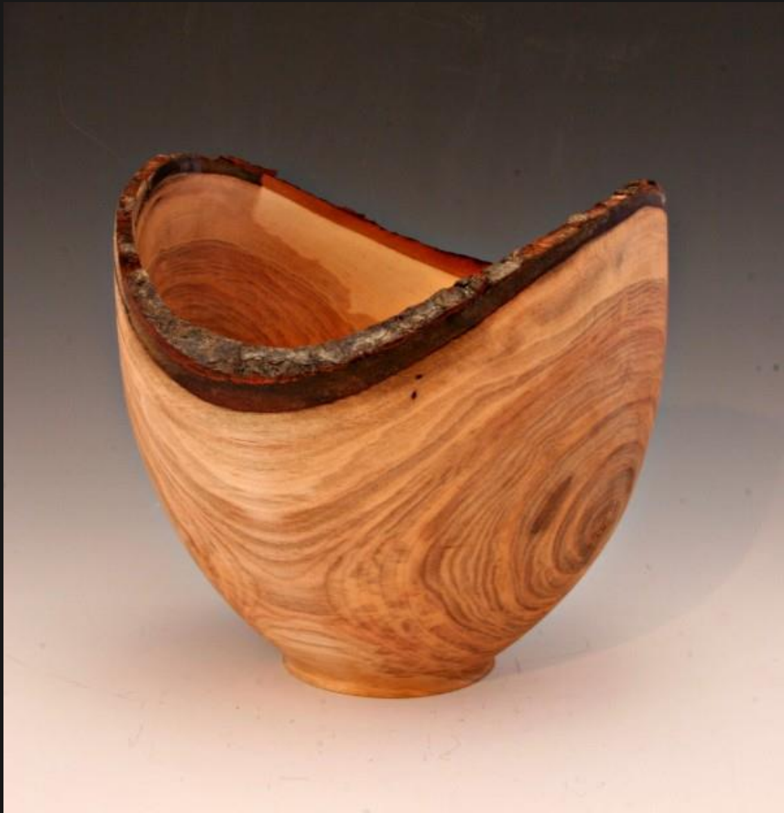
“Forest 2” Cherry Bowl by Greg Wandless