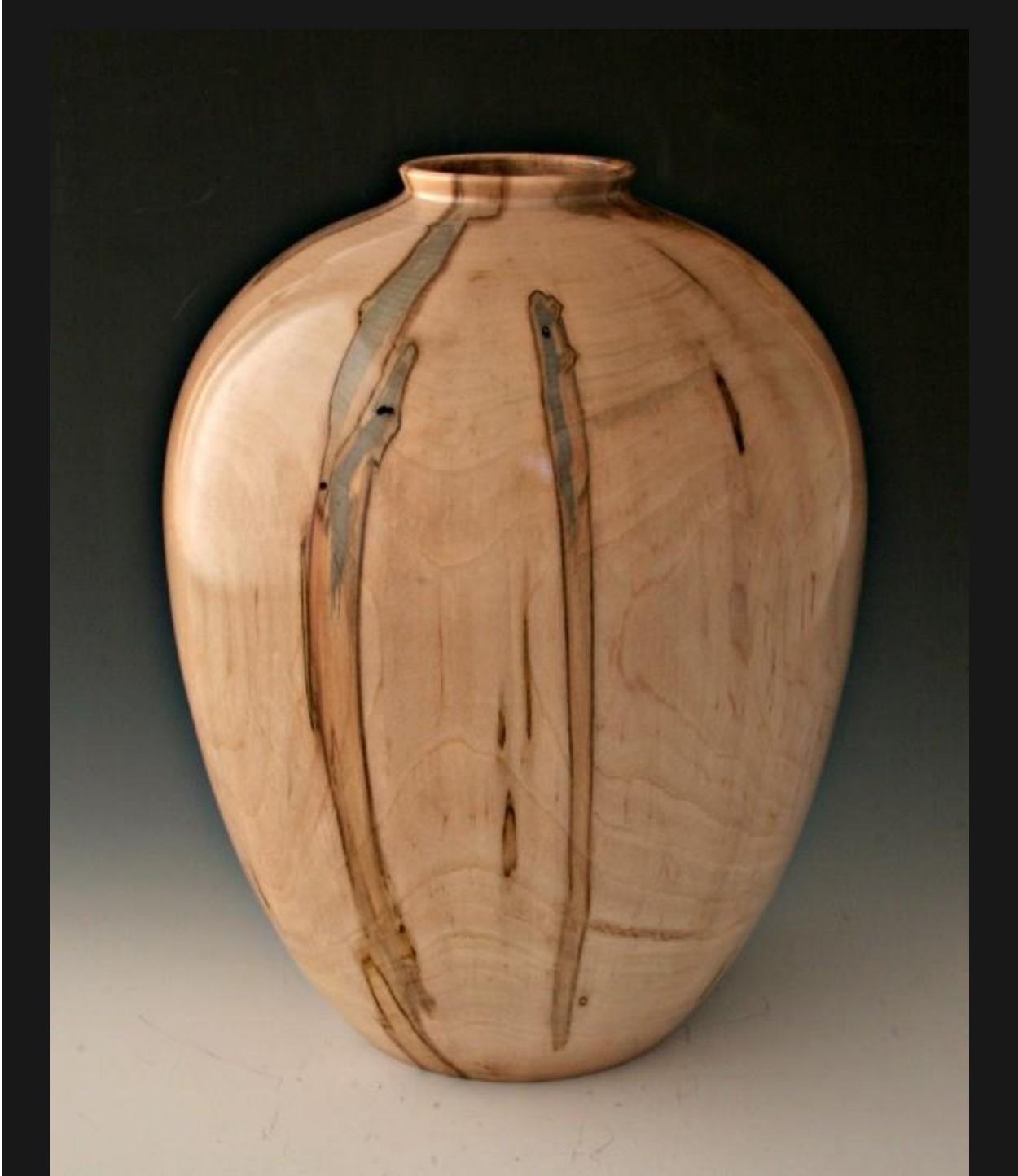
“Forest 1” Maple Vase by Greg Wandless